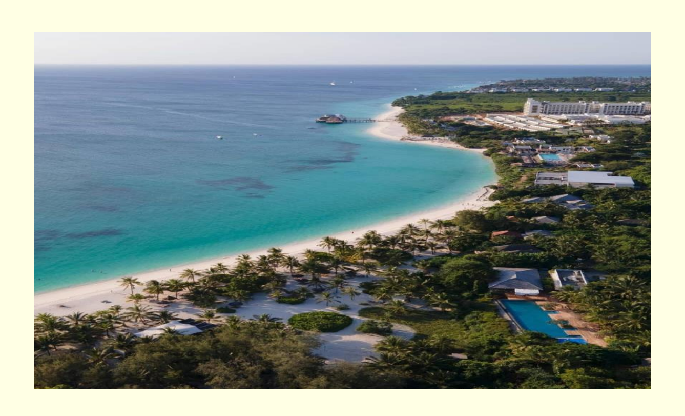
TOURISM STATISTICAL RELEASE JUNE – 2023